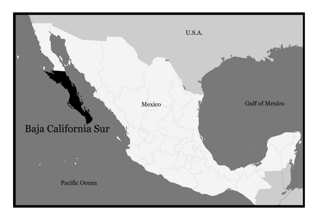
Figure 1: Location of Baja California Sur, Mexico.

While the park itself has achieved recent successes, the community of Cabo Pulmo still faces many internal social, political, economic, and infrastructural problems. The park receives national and international support and attention, but most of the local Mexican residents<sup>2</sup> still lack many basic resources such as public water infrastructure, power, health services, schools, and even clearly defined public spaces (see Gerber 2008; Gámez and Montaño 2004). The roads are unpaved. The nearest health clinic is at least 30 minutes away—and longer if the roads are washed out. The small elementary school was destroyed in 2005 when hurricane John swept through the peninsula. All that remains is an empty, forlorn concrete shell out on Cabo Pulmo point. There is a pre-school, but the rest of the community's young students take a forty minute bus ride into the neighboring pueblo of La Ribera. As for water, while the expats have plenty (although it's not cheap), the Mexican community has been fighting to make the government build reliable water infrastructure. While the national park has received considerable government attention and support, the needs of the local community lag far behind. Some members of the community, however, are pushing back...using discourses about sustainability as primary modes of social organization.